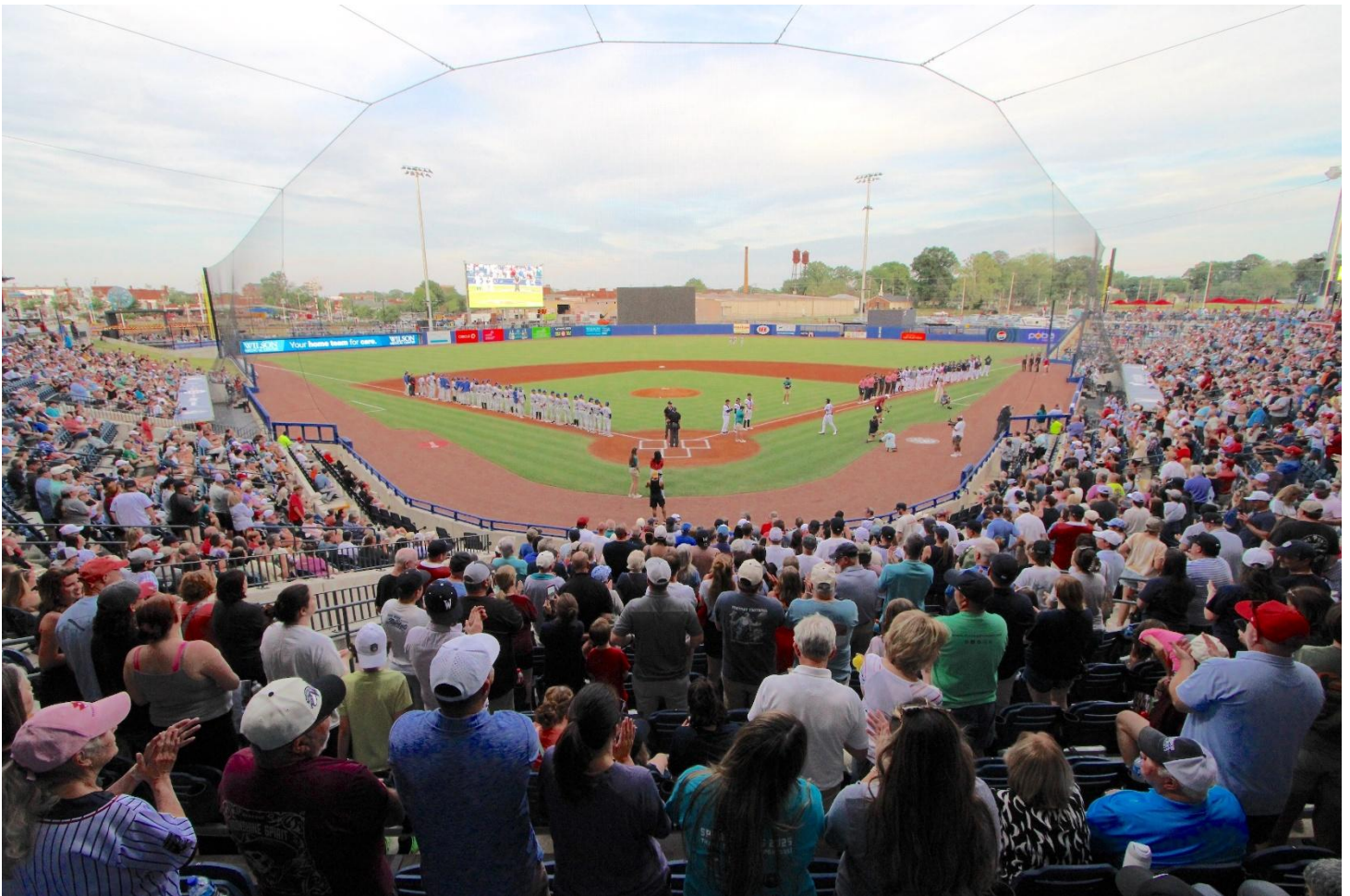
Wilson Warbirds Opening Day